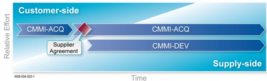
Figure 2. Roles of Business “Customer” and IT “Suppliers”

The Acquisition lifecycle process integrates with the engineering/development lifecycle to assure capabilities are delivered with maximum ROI.