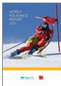
World Insurance Report

Capgemini's yearly reports provide insight into the financial services industry