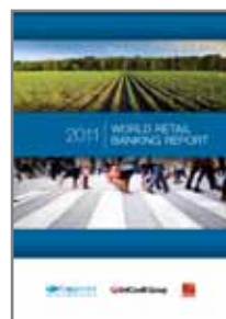
World Retail Banking Report