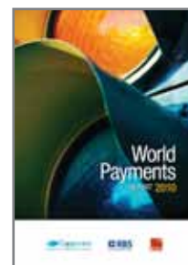
World Payments Report