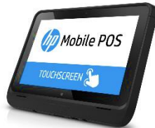
10" Mobile Retail Solutions diagonal