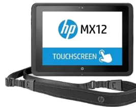
12" Mobile Retail Solutions