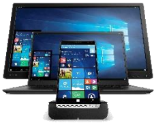
6" Mobile Retail Solutions