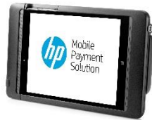
8" Mobile Retail Solutions diagonal