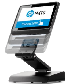
HP MX10 Retail Solution and MX12 Retail Solution