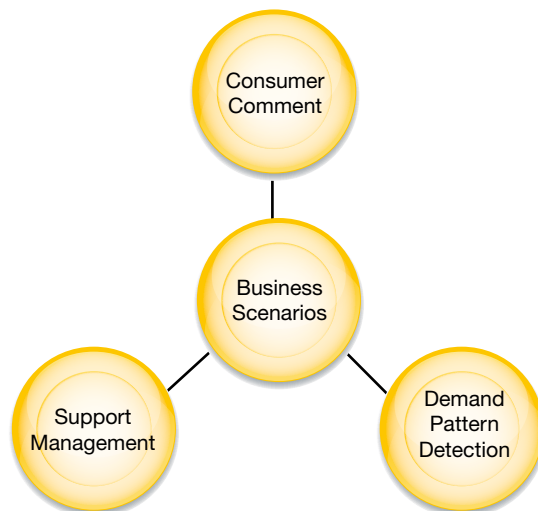
Figure 2: Social Media Solution Business Scenarios

Capgemini's solutions enable a retailer to take full advantage of social media. They enable intimacy with the consumer, while automating transactions and interactions, thereby hitting that sweet spot of delivering better service at a lower cost. The rich and timely connections made possible by social media can increase brand awareness, create a buzz around new products and services, improve consumer satisfaction, and build consumer loyalty.