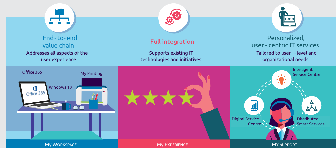
Figure 1: My Experience creates a seamless work environment that merges any-app/any-device flexibility with responsive, adaptive support for a superior user experience.