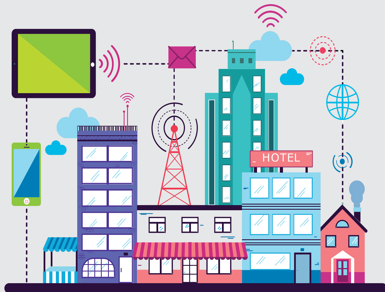
Figure 5: The Distributed Smart Services offering personalizes on-site support at the organization level through a wide array of options.

On-site support delivered when, where, and how you need it.