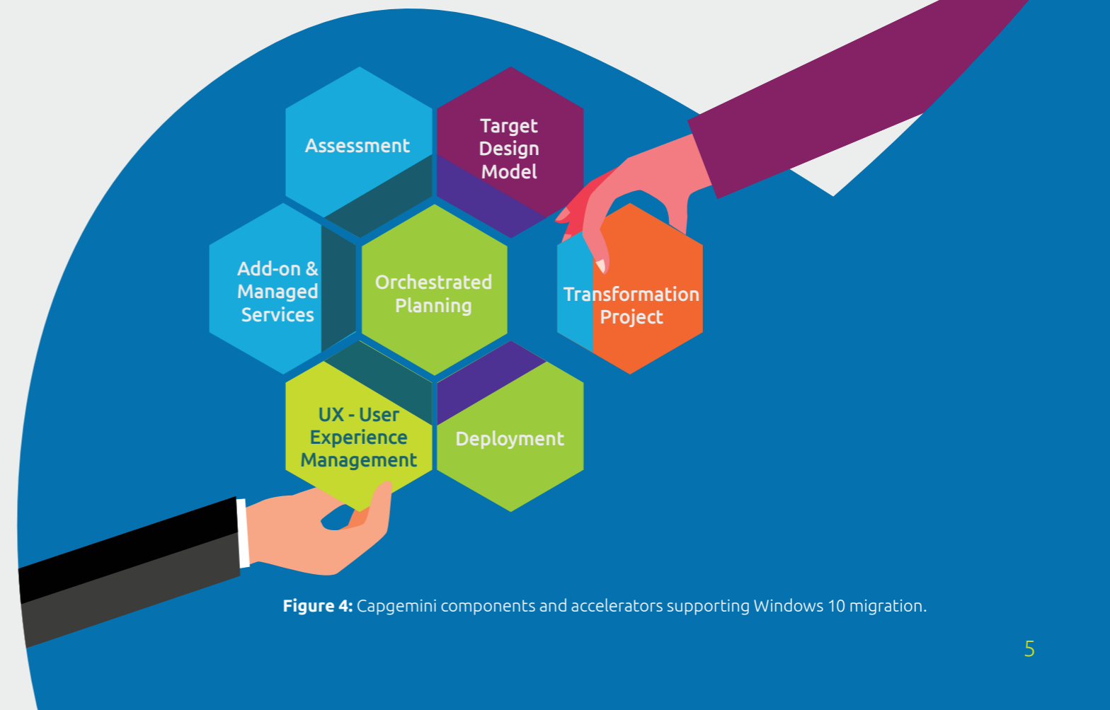
Figure 4: Capgemini components and accelerators supporting Windows 10 migration.