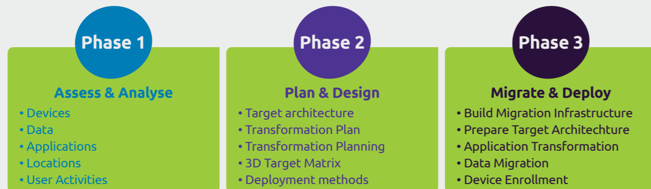
Figure 3: Key phases of the Windows 10 Migration Service.

Typically, the migration process includes three key phases, summarized in the figure below.