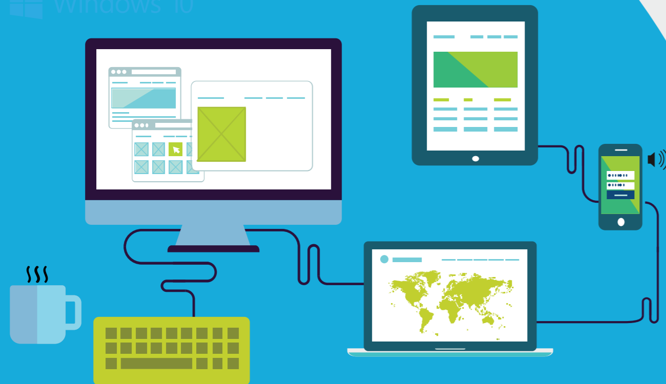
Figure 1: Windows 10 multi-device capabilities