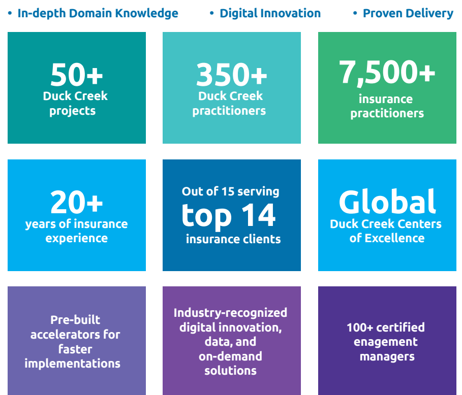
Fig 1: Capgemini Differentiators

As a Duck Creek Platinum Partner, we have served 35+ clients with Duck Creek implementations since 2007. Along with this, we have advanced, industry-recognized digital capabilities to provide strategic roadmaps to clients that need to embrace the future needs of a connected experience.