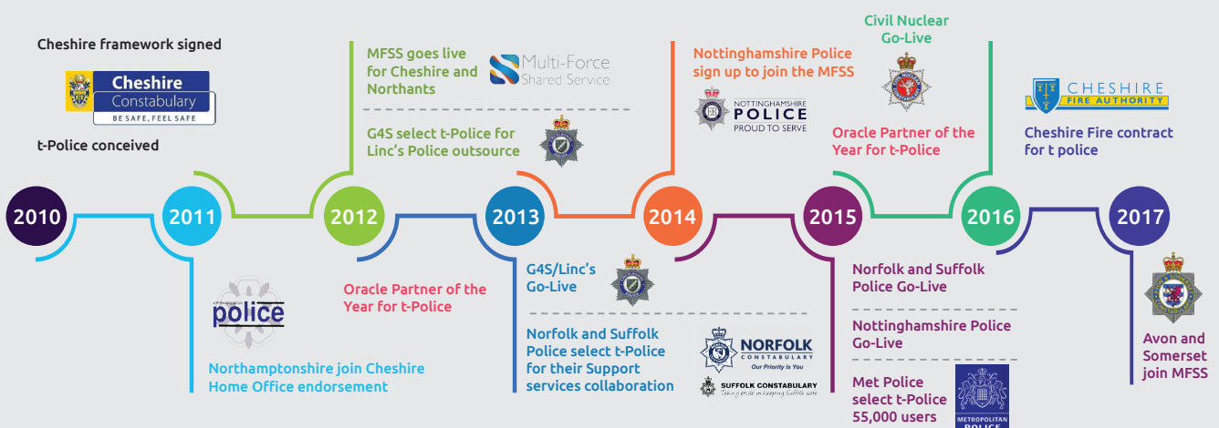
Figure 1: Evolution timeline