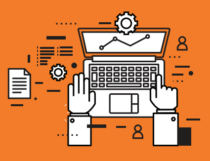
Transparency refers to openness, accountability and trust.