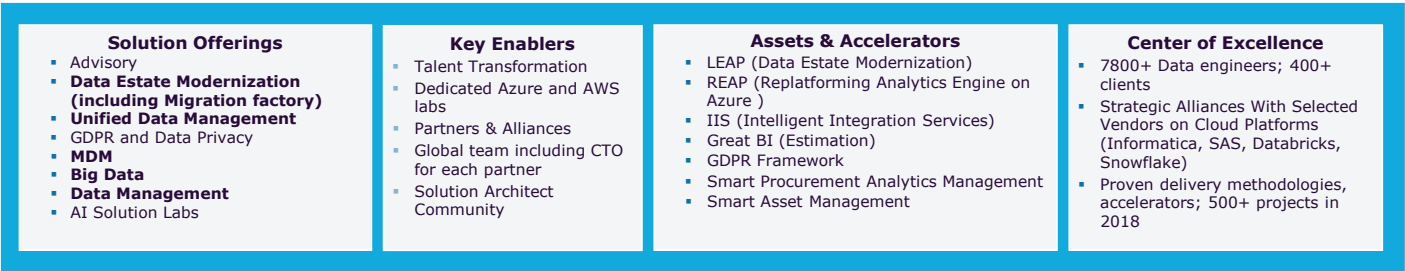
Figure 4: Capgemini’s AI & Data Engineering capabilities

With Capgemini’s capabilities, enterprises find they can do more with AI than they ever thought possible. We have more than 7,800 engineers with the appropriate skills, and have worked with more than 400 clients. In 2018 alone, we ran at least 500 projects in this area.