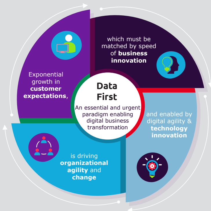
Figure 2: Data centrality is an essential enabler of business transformation

The Perform AI portfolio is underpinned by a data and AI technology platform called AI & Data Engineering. The focus on data as well as AI reflects today's constant data-centricity. As the figure below shows, data centrality is the key to enabling business and technology innovation and accelerating organizational agility and change. In short, there is no innovation without knowledge, and no knowledge without trusted data.