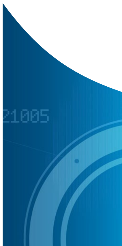
Exhibit 2: Reference Models Expertise

Additionally, our professionals can call upon our proven Structured Expert Method for Business Analysis (SEMBA) approach when gathering requirements for such projects, as well as a proprietary data migration approach and more than 17,000 test cases for retail and corporate banking.