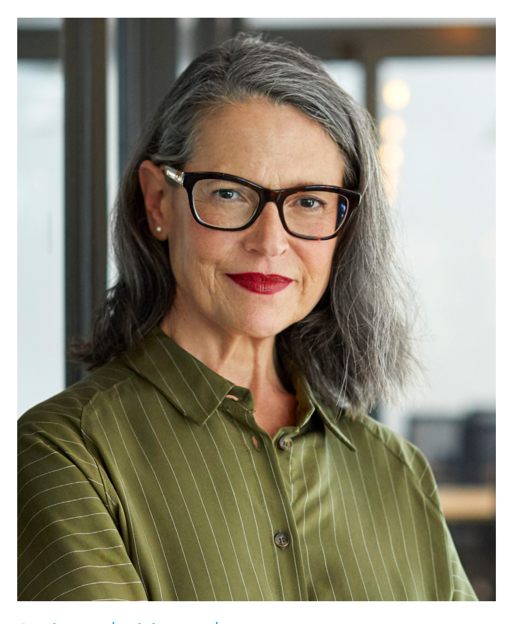
Business decision makers Seeking to take advantage via seamless solutions and insights needed daily.