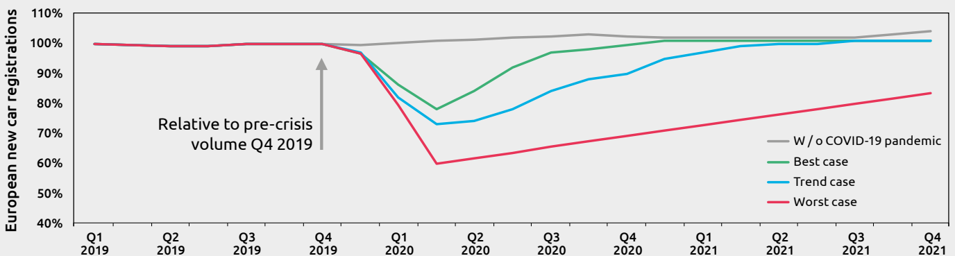
figure 1 | Capgemini Invent scenarios for automotive market recovery in Europe

projections by the German Council of Economic Experts (see figure 1). Even in the best-case scenario, a strong deviation from pre-crisis forecasts is to be expected for at least a year. However, this would require the quick recovery of global supply chains, good product availability, and fast recovery of vehicle demand. More pessimistic researchers and industry experts predict a much deeper crisis, with a slow three-to-five-year recovery phase. A scenario which frightens automotive managers, employees and shareholders alike. Our research suggests a less dramatic, milder trend case, with a recovery phase until the end of 2021. Several facts and recent developments support this prediction, including the rebound of the Chinese market, the currently well-functioning restart of the industry's supply chain, and purchase incentives planned by European governments, such as bonuses for the purchases of electric vehicles.