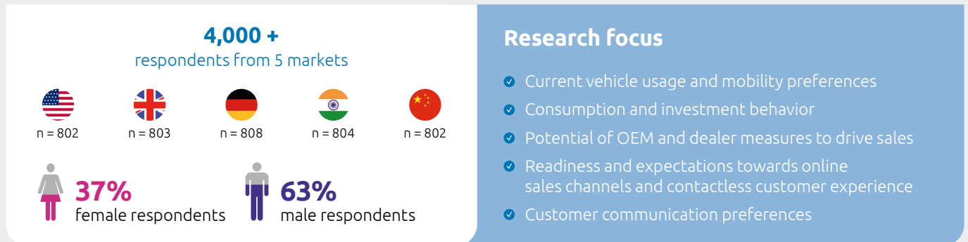
Figure 2 | Capgemini Invent Global Sales Recovery study facts

Investigating the most effective levers to recover automotive sales, we start at the customers' perspective. We surveyed over 4,000 customers with car purchase intentions in 5 markets; Germany, US, UK, China and India.