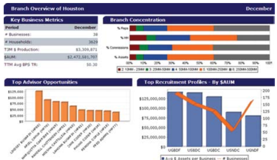
Figure 2. The regional view provides a closeup of performance and development opportunities for a single region

Comprehensive performance, client and advisor information show regional and branch managers who are high-performers and how the average advisor can better capture customer and business opportunities. See Figure 2.